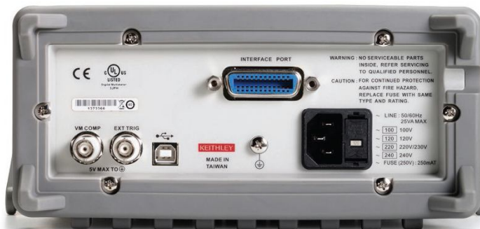
Model 2110 rear panel.

Input bias current: <30pA at 25°C. Input protection: 1000V all ranges (2W input). AC CMRR: 70dB (for 1kΩ unbalance LO lead). Power Supply: 100V/120V/220V/240V. Power Line Frequency: 50/60Hz auto detected. Power Consumption: 25VA max. Digital I/O interface: USB-compatible Type B connection, GPIB (option). Environment: For indoor use only. Operating Temperature: 0° to 40°C. Operating Humidity: Maximum relative humidity 80% for temperature up to 31°C. Storage Temperature: –40° to 70°C. Operating Altitude: Up to 2000 m above sea level. Bench Dimensions (with handles and bumpers): 107 mm high × 252.8 mm wide × 305 mm deep (3.49 in. × 9.95 in. × 12.00 in.). Weight: 2.23 kg ( 4.92 lbs.). Safety: Conforms to European Union Low Voltage Directive, EN61010-1. Measurement Cat 1 1000V and CAT II 600V. EMC: Conforms to European Union Directive 89/336/EEC, EN61326-1. Warranty: Three years.