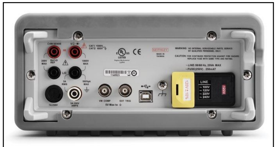
Model 2100 rear panel

AC CMRR: 70dB (for 1kΩ unbalance LO lead). POWER SUPPLY: 120V/220V/240V. POWER LINE FREQUENCY: 50/60Hz auto detected. POWER CONSUMPTION: 25VA max. DIGITAL I/O INTERFACE: USB-compatible Type B connection. ENVIRONMENT: For indoor use only. OPERATING TEMPERATURE: 5° to 40°C. OPERATING HUMIDITY: Maximum relative humidity 80% for temperature up to 31°C, decreasing linearly to 50% relative humidity at 40°C. STORAGE TEMPERATURE: –25° to 65°C. OPERATING ALTITUDE: Up to 2000m above sea level. BENCH DIMENSIONS (with handles and feet): 112mm high × 256mm wide × 375mm deep (4.4 in. × 10.1 in. × 14.75 in.). WEIGHT: 4.1kg (9 lbs.). SAFETY: Conforms to European Union Directive 73/23/ECC, EN61010-1, UL61010-1:2004. EMC: Conforms to European Union Directive 89/336/EEC, EN61326-1. WARRANTY: One year.